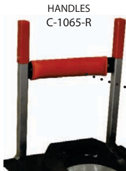
RED ARMREST & HANDLES

••••• PADDED VINYL VELCRO BACKREST C-1811-R