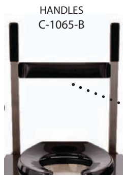
BLACK ARMREST & HANDLES

••••• PADDED VINYL VELCRO BACKREST C-1811-R